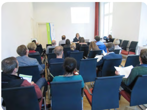
Bonn Sustainability Portal network event, 29 September 2015, Bonn

From 24–25 September 2015 the 4th PhD conference on International Development took place at Ruhr-University Bochum, Germany. Another event for PhD students organised in cooperation with EADI was the ISS Development Dialogue on "The ghosts of MDGs: Unpacking the logics of development" at the International Institute of Social Studies in The Hague on 5/6 November. On 7 November 2014 a UEL International Development Society Undergraduate Conference entitled