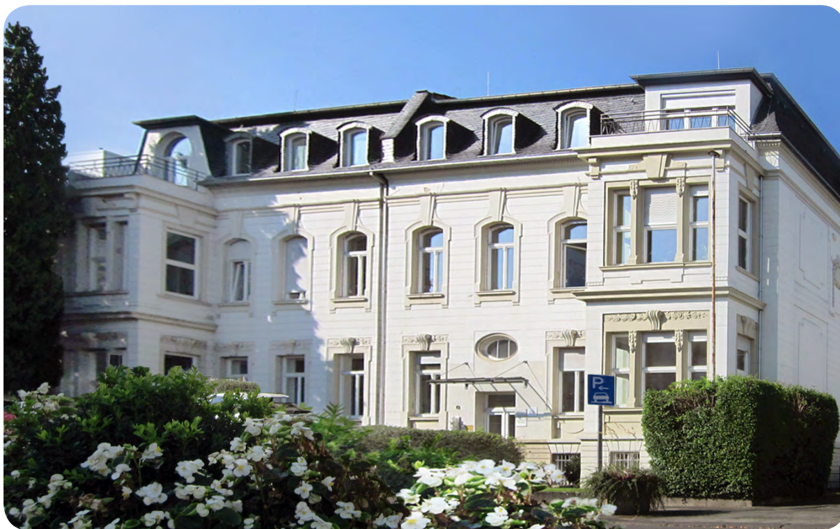
EADI secretariat (left side, top floor), Bonn