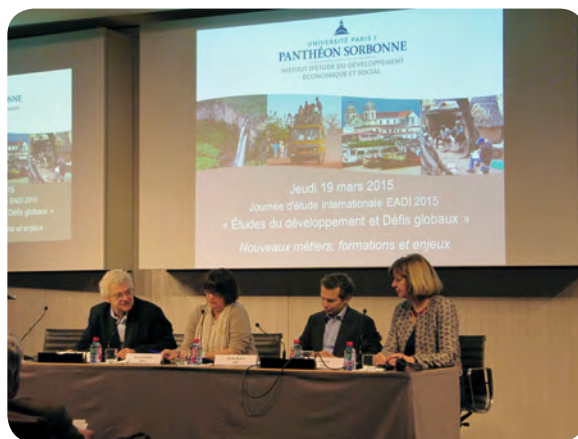
EADI Seminar 19 March 2015, at AFD, Paris