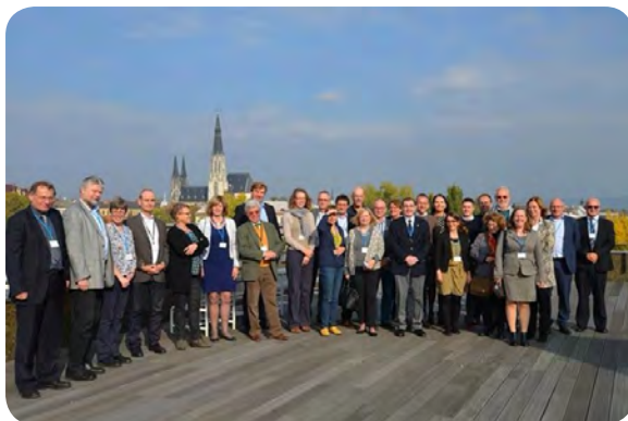
Directors' Meeting 28 October 2015, Olomouc, Czech Republik

and was hosted by the Department of Development Studies, Palacky University on 28 October 2015. The meeting focused on a renewed Vision of Development Studies, and the topic of Big Data. It was embedded in a conference on “Searching for Sustainable Living. Different Approaches, Shared Vision”.