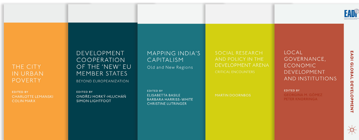
EADI Global Development Series, book covers