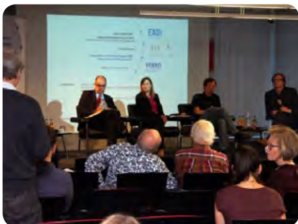
Bonner Impulse panel discussion, at DIE, 28 September 2016, Bonn

In cooperation with GIZ, World Conference Center Bonn, University of Applied Sciences Bonn-Rhein-Sieg, Engagement Global and the University of Bonn, EADI maintains a network and information portal on sustainability. In September 2016, one network event was organised on new media initiatives in Bonn in cooperation with the Bonn Social Bar. The UN Knowledge Center for Sustainable Development joined the portal as associate partner in 2016. FEMNET e.V., a non-profit organisation, which stands up for the economic, cultural and social rights of women, was the portal’s annual