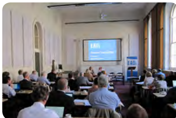
Directors' Meeting 6 June 2016, at King's College, London, United Kingdom