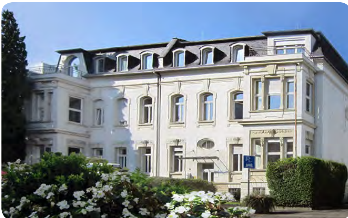
EADI secretariat (left side, top floor), Bonn