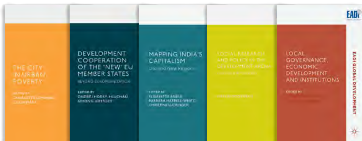
EADI Global Development Series, book covers

The EADI eNewsletter is an efficient and frequently visited information service helping EADI members as well as the general public to stay informed about the development research community. It features news from EADI, members and partners, from EADI working groups, news on training courses, calls for papers, job offers and conferences. In addition, a weekly publication digest is