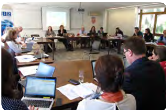
Executive Committee meeting 14/15 April 2016, at EIZ, Zagreb, Croatia

EADI Directors' Meetings have been a tradition since 2002. At the 10th General Conference, it was agreed to hold meetings of the directors of EADI member institutes on a regular basis to carry forward the cooperation between institutes and improve knowledge management and exchange between organisations. In 2016, the