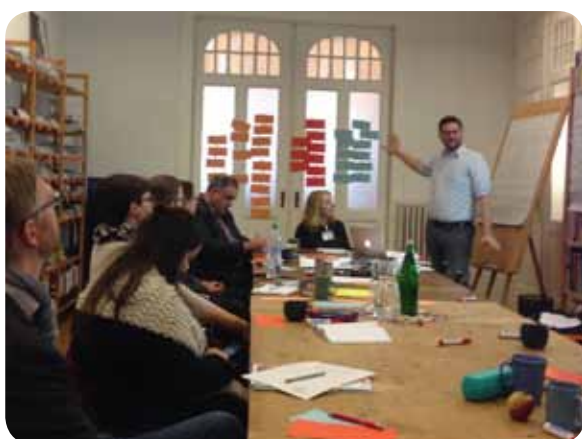
COP23 workshop, at EADI Secretariat, 10 November 2017, Bonn, Germany

Regularly updated and maintained by the Secretariat team, the website features the latest EADI news and