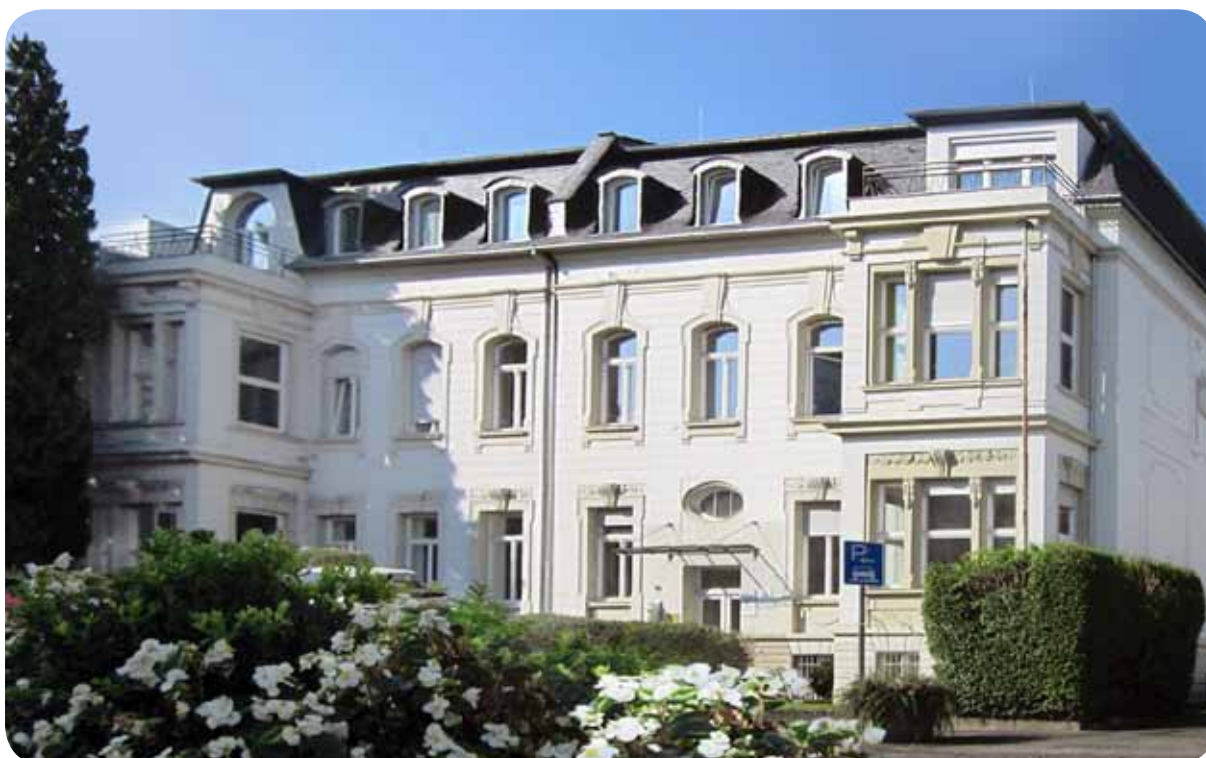
EADI secretariat (left side, top floor), Bonn