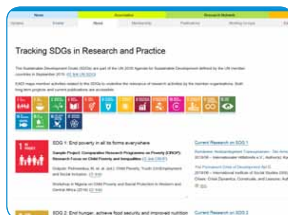
Tracking SDGs in Research and Practice (screenshot), new feature on the EADI website