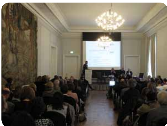
Panel at the Bonner Impulse, at the Old Town Hall, 21 March 2017, Bonn, Germany

In cooperation with GIZ, World Conference Center Bonn, University of Applied Sciences Bonn-Rhein-Sieg, Engagement Global and the University of Bonn, EADI maintains a network and information portal on sustainability in Bonn. The portal was successfully relaunched in January 2017 and is well established within local organisations targeting sustainable development. Focusing on climate, the BSP organised and participated at events during the UN Climate Conference (COP23) in Bonn including a workshop on “Participation in sustainable cities – locally and globally” held on 10 November 2017 and a discussion about “Great Climate?” on 13 November 2017. The German Development Institute / Deutsches Institut für Entwicklungspolitik (DIE) joined the portal as associate partner in 2017. Foodsharing Bonn, a local initiative for reducing food