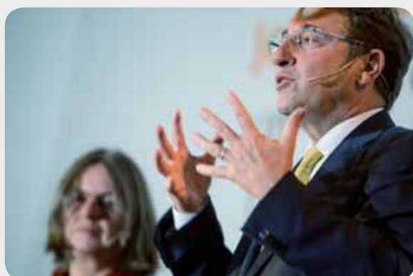
Closing Plenary: Sustainability and the Green Shift in an Era of Disruptions