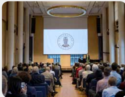
Dudley Seers Lecture: Inequality and Financial Power: A Macroeconomic and Comparative View