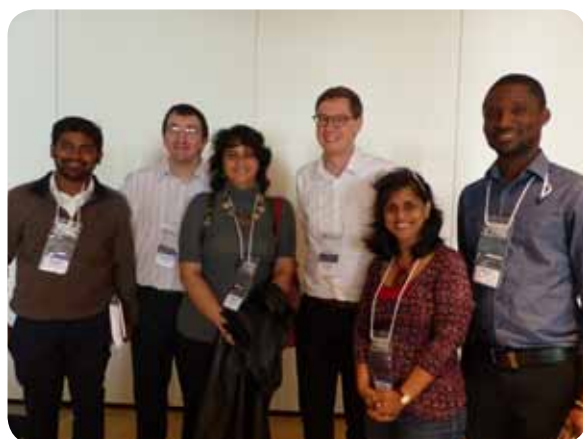
JUMP writing workshop, at EADI NORDIC Conference 2017, August 2017, Bergen, Norway

The JUMP Mentoring Programme offers (young) Southern researchers the opportunity to work closely with an experienced scholar from their field of interest with the aim of preparing a paper that is (subject to the regular peer-review process) accepted for publication in the EJDR. 20 young researchers from the Global South participated in the one-day writing workshop at the EADI NORDIC Conference 2017 that kicked off the programme. Mentees were paired with their mentors, introduced to the basics of writing a paper for academic high-ranking publishing and had the opportunity to network. In addition, mentees also presented their work in several panels during the conference. Conference fees, travel and accommodation expenses of the mentees were covered by the programme. In 2018, successful papers will be published in the EJDR.