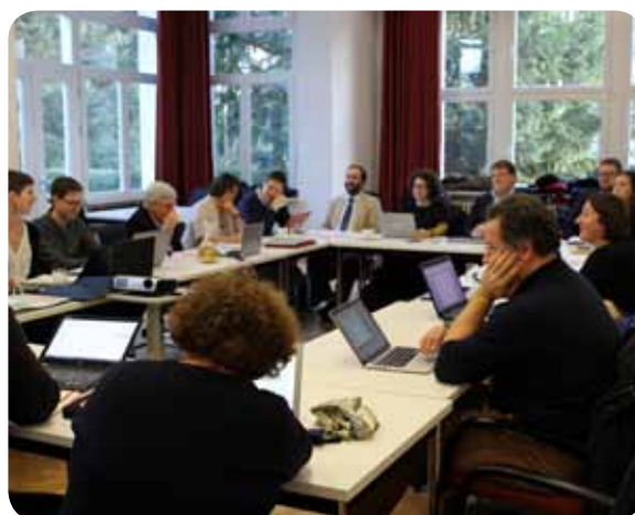
Executive Committee meeting 8 December 2017, at EADI Secretariat, Bonn, Germany