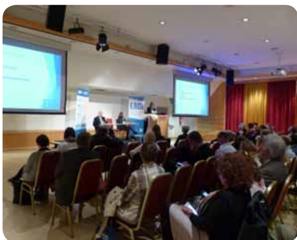
Executive Committee election 22 August 2017, at EADI NORDIC Conference, Bergen, Norway

The 2017 EADI Seminar took place in conjunction with the Executive Committee Meeting in Tampere on 10 April 2017. It was organised by the University of Tampere, Global Health and Development in collaboration with the Finnish University Partnership for International Development (UniPID). The EADI collaboration seminar was entitled "Global Governance and Responsibility" and brought together key development scientists and experts from Europe and beyond, including delegates from low and middle-income countries. In an inclusive and participatory mini panel setting participants discussed issues of (Higher) Education and Innovation, Environment, Global Wellbeing and Social Protection under the broader seminar topic. The seminar provided a valuable platform for debate and the dissemination of meaningful messages, findings and practices in the subject.