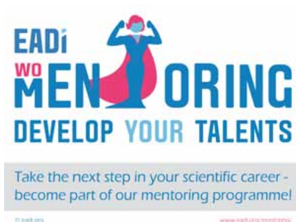
EADI mentoring programme advertisement, programme website: https://www.eadi.org/talents/

Another event for PhD students organised in cooperation with EADI, was the ISS Development Dialogue on “Localizing the ‘Global’: Global Development and Social Justice in Practice” from 11-13 October at the International Institute of Social Studies in The Hague.