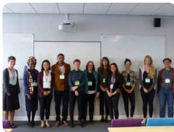
Panel at the DSA Conference 2017, at University of Bradford, 6 September 2017, Bradford, UK