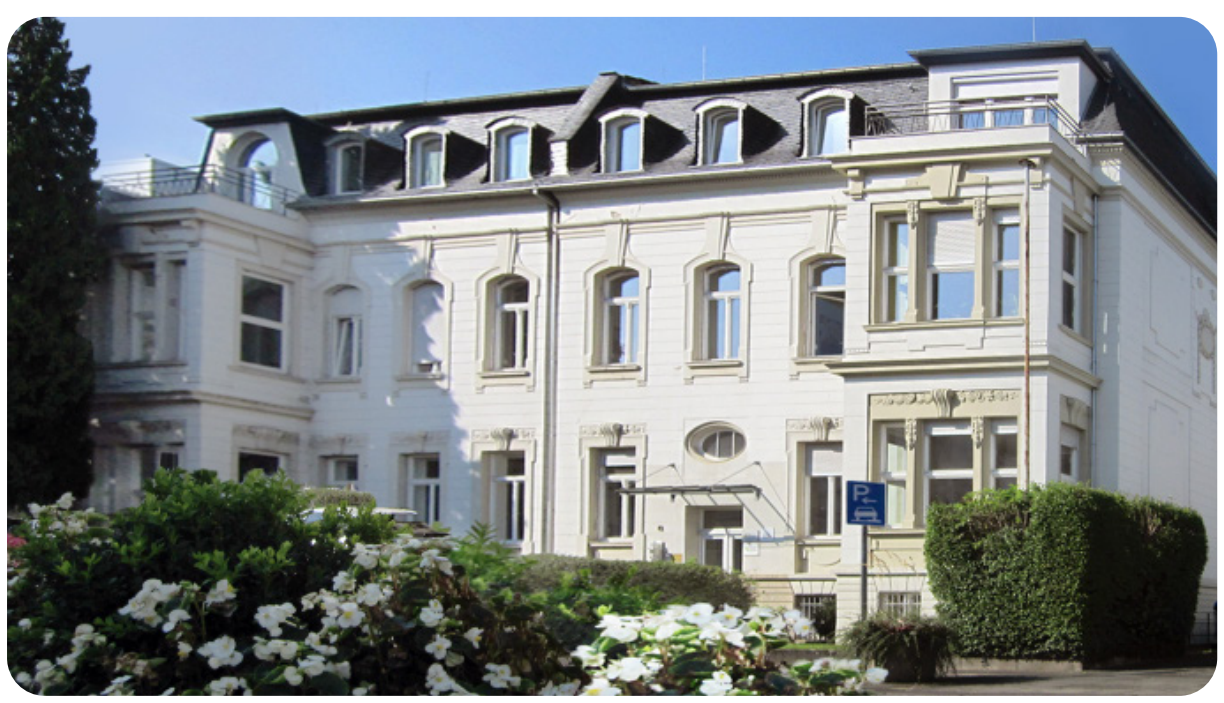
EADI secretariat (left side, top floor), Bonn