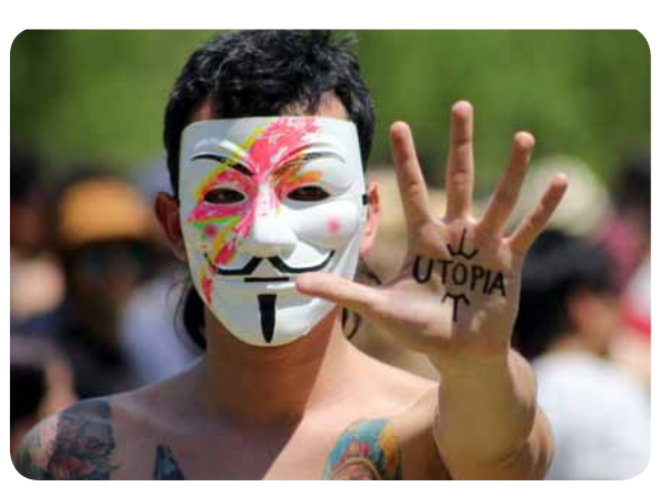
It is time to abandon "development" goals and demand a post-2030 Utopia, blog post 11 August 2020.