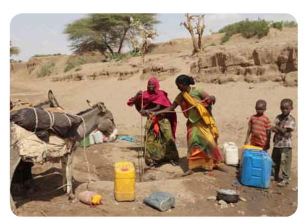
Disaster response: why democracy matters, blog post, 14 July 2020.