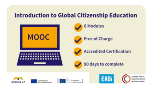
Bridge 47 MOOC: Introduction to Global Citizenship Education

https://www.eadi.org/bridge-47-building-global-citizenship/