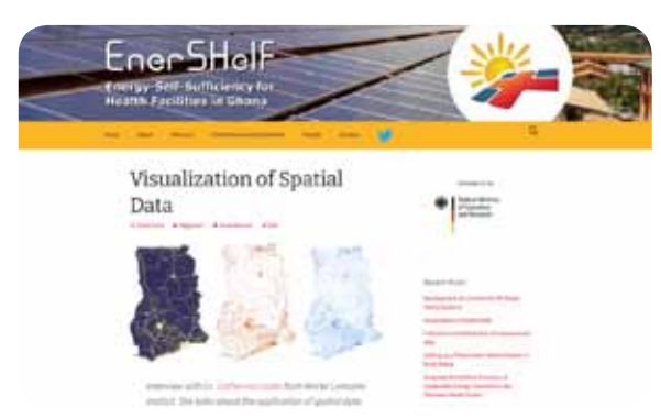
EnerSHelF Website https://enershelf.de/

At the beginning of 2020, EADI launched the project's website https://enershelf.de/. It serves as the main communication tool and offers an insight into the progress of the project. As the communication and dissemination partner, EADI contributed by constantly updating the EnerSHelF website. EADI conducted 18 individual interviews with the researchers and published seven articles on the status of the project. Besides written interviews, two video interviews can be found on the website. Additionally, the EnerSHelF Twitter account proved to be a valid tool to disseminate news, and also to connect with other organisations and people in the field of renewable energy. To directly reach out to the stakeholders of EnerSHelF, EADI sends out circular letters presenting the status of the project. Besides appearing on EADI's own communication platforms, EnerSHelF news were regularly posted on the Client II website and newsletter. Furthermore, one of EADI's articles got featured on the BMBF's platform FONA -Research for Sustainability.