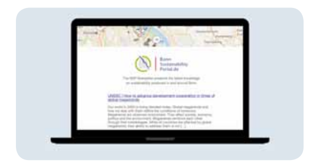
Updated Newsletter-Design of the Bonn Sustainability Portal Newsletter

The portal's social media channels were relaunched with new media templates giving the channels a uniform appearance with a high recognition value. The newsletter design was revised, and new subscribers were acquired with a targeted mailing campaign. To further strengthen the visibility of the Bonn Sustainability Portal, it was also featured in the International Newsletter of the City of Bonn.