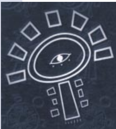
Valdivia Cosmology, Ecuador (1,500 a.C.)

given them their first opportunity to gain an impression of a country previously unknown to them, or that they had been able to widen their perspective.