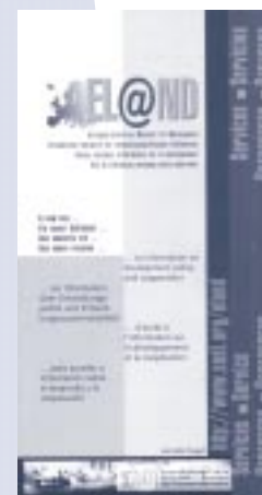
Flyer available in the EADI Secretariat, Bonn

OWE – OneWorld Europe, Maastricht; www.oneworld.org/europe